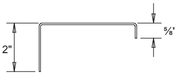
Optional Flange Frame